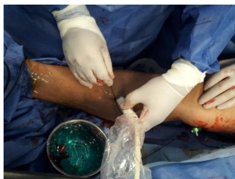
Ultrasound guided needle insertion